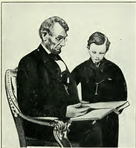
LINCOLN AND HIS SON "TAD."

From photograph taken while Lincoln was President.